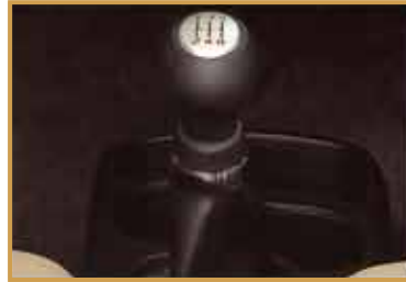
Smooth Gear Shift