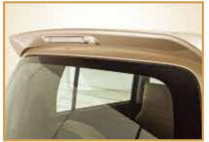
Rear Upper Spoiler