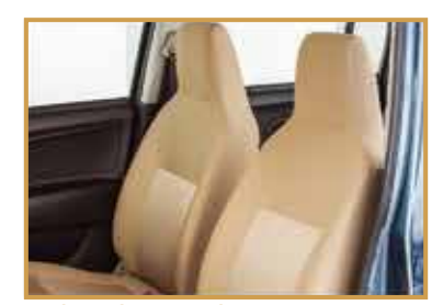
High-Quality Seat Fabric