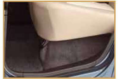
Rear Flat Floor