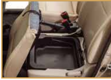
Front Passenger Under Seat Tray