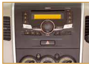
Integrated Sound System