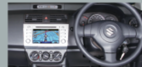
An integrated Car Navigation System with Rear View Camera