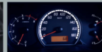
Sporty, Easy-to-Read Tachometer with tripmeter & illumination control