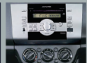
Integrated Sound System